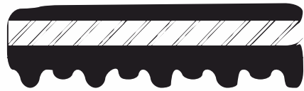
STYLE A - STEEL PLATE BONDED BETWEEN NR AND FLATBACK PADS