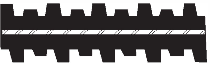
STYLE E -GALVANIZED STEEL PLATE BONDED BETWEEN MULTIPLE NR PADS